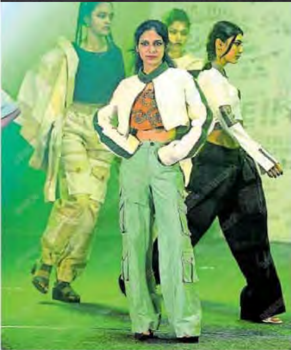
ലോകം കൈമാറി മുന്നോട്ടു പോകുന്ന വിഭാവനം നടന്നുവന്ന ഹാൻഡ്ലോം ഡേ 2024-ൽ പങ്കെടുത്തവരുടെ ചിത്രം. മുകളിൽ: സമീപ്